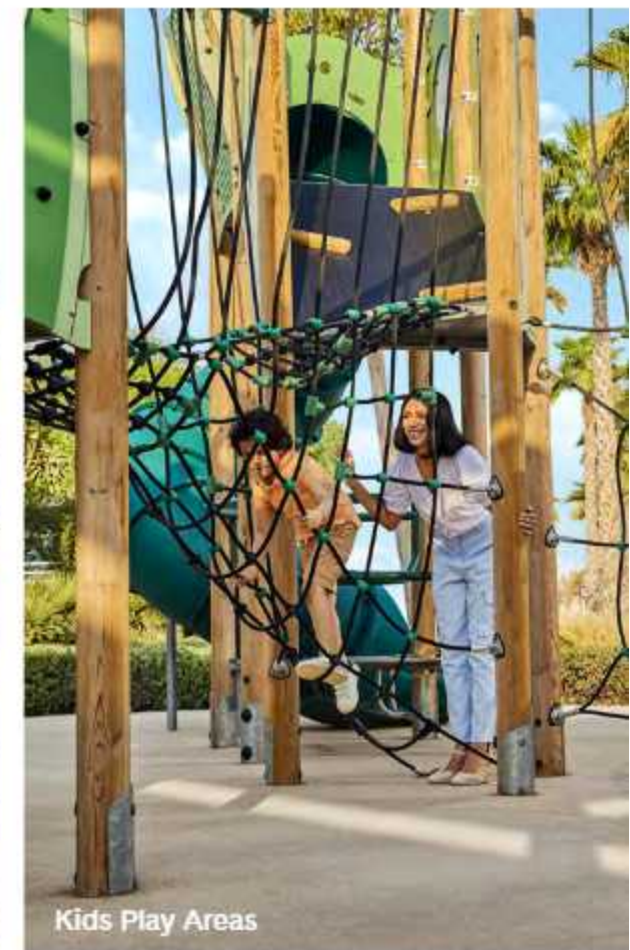
Kids Play Areas