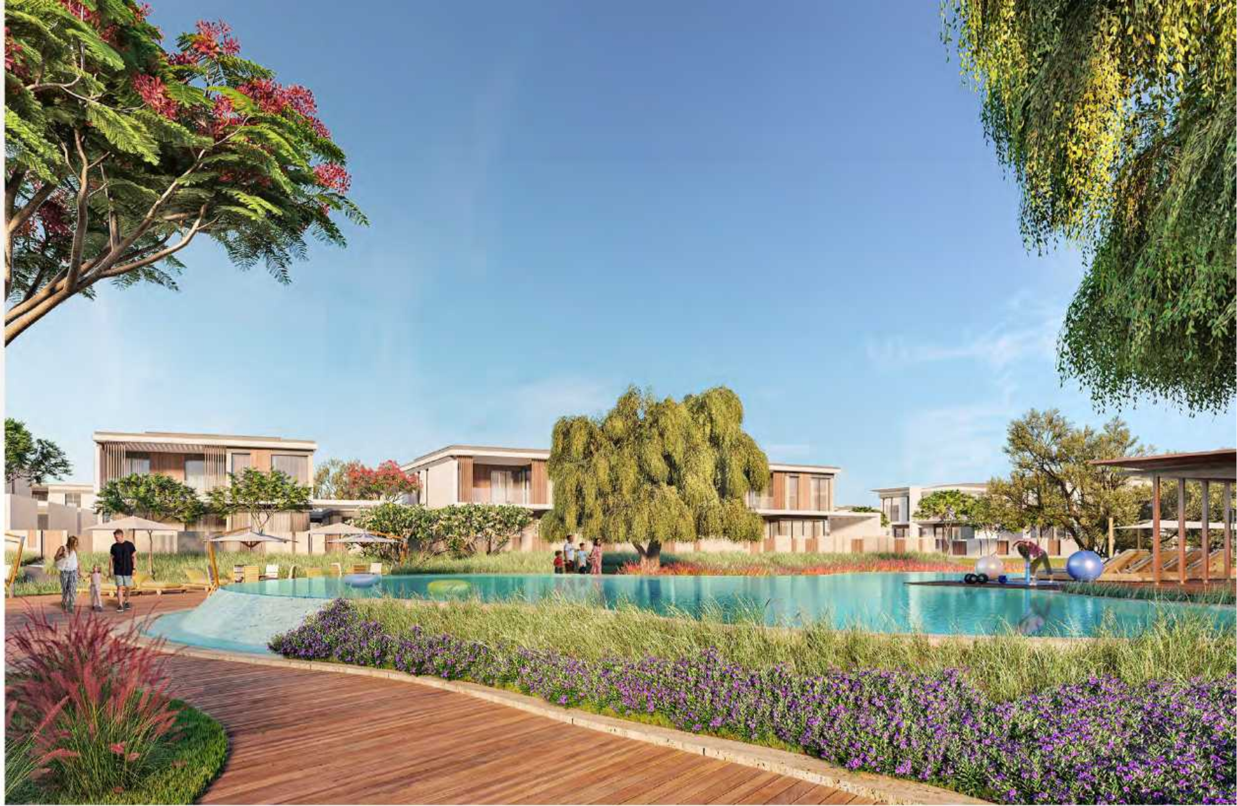
Harmony Main Park Pool View

Health and well-being is at the heart of the community with resort style amenities that include a fitness centre, paddle tennis court, dedicated yoga spaces and running tracks that connect it all.