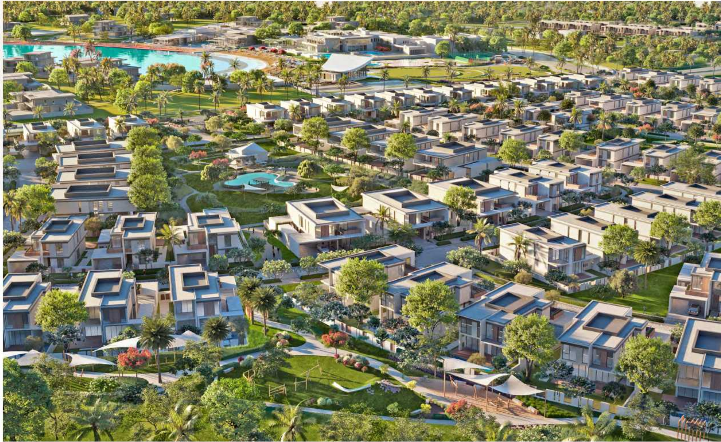
Aerial View of Harmony

This is an invitation to Live in Harmony. 243 exclusive villas designed to create a refreshing and vitalizing balance that permeates and connects a community. It's a balance that can be found in the timeless architecture, the open connected landscape, and the expansive views that lead to organic experiences. Here, we call home - Harmony.