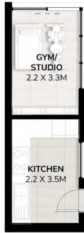
Layout 2 Wellness