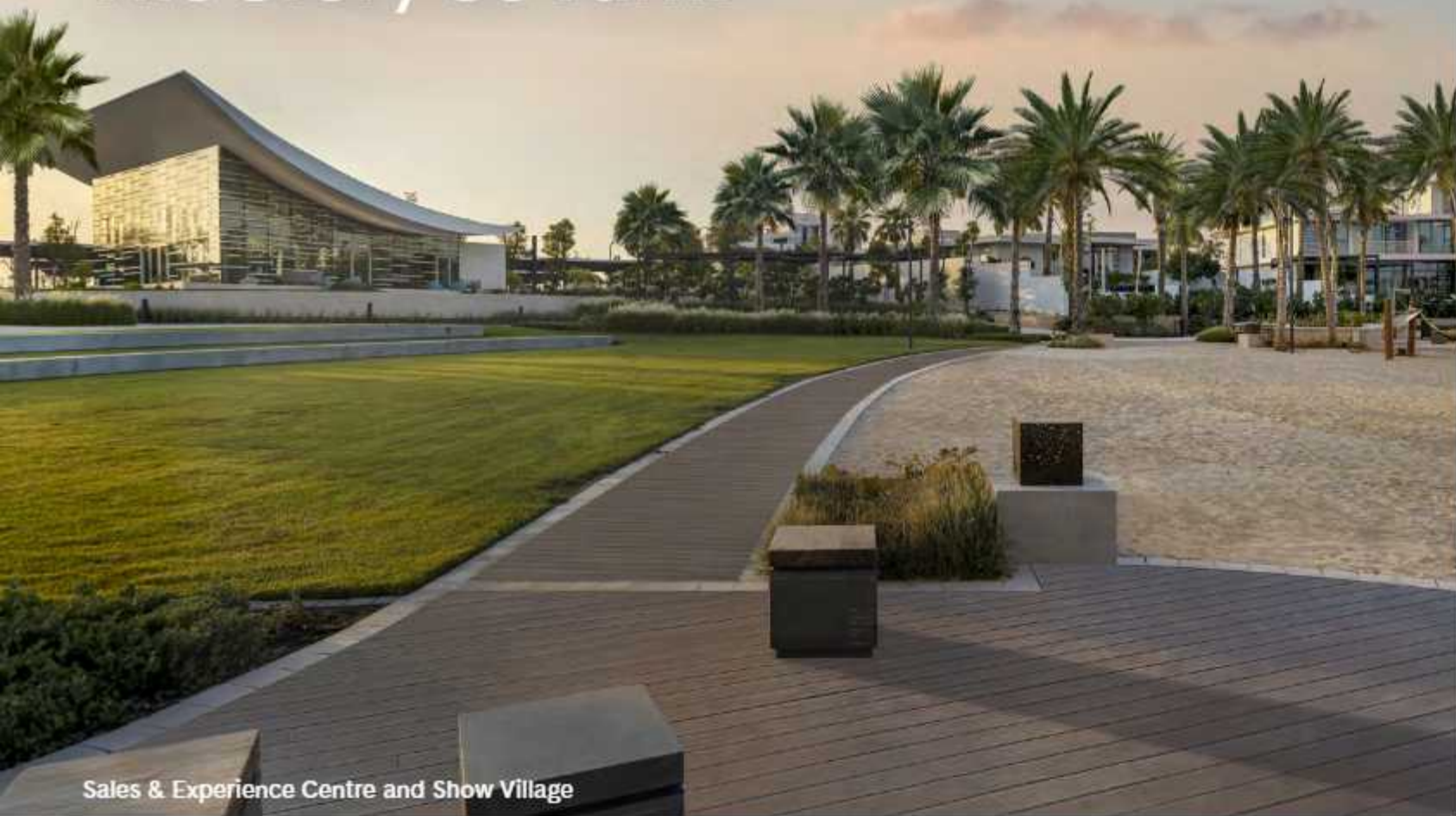
Sales & Experience Centre and Show Village