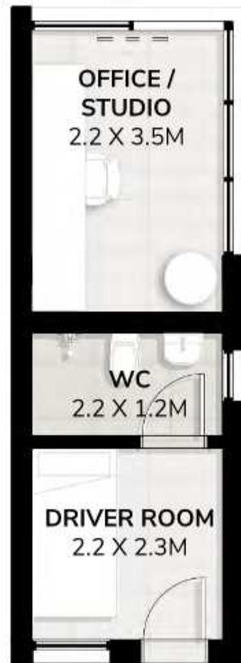
Layout 1 Creative