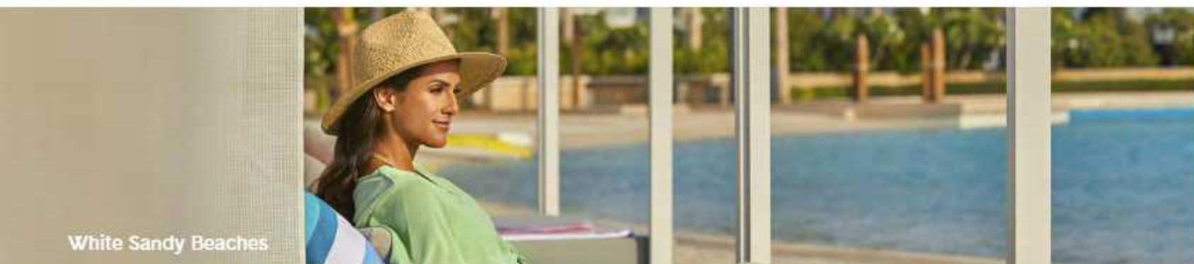
White Sandy Beaches