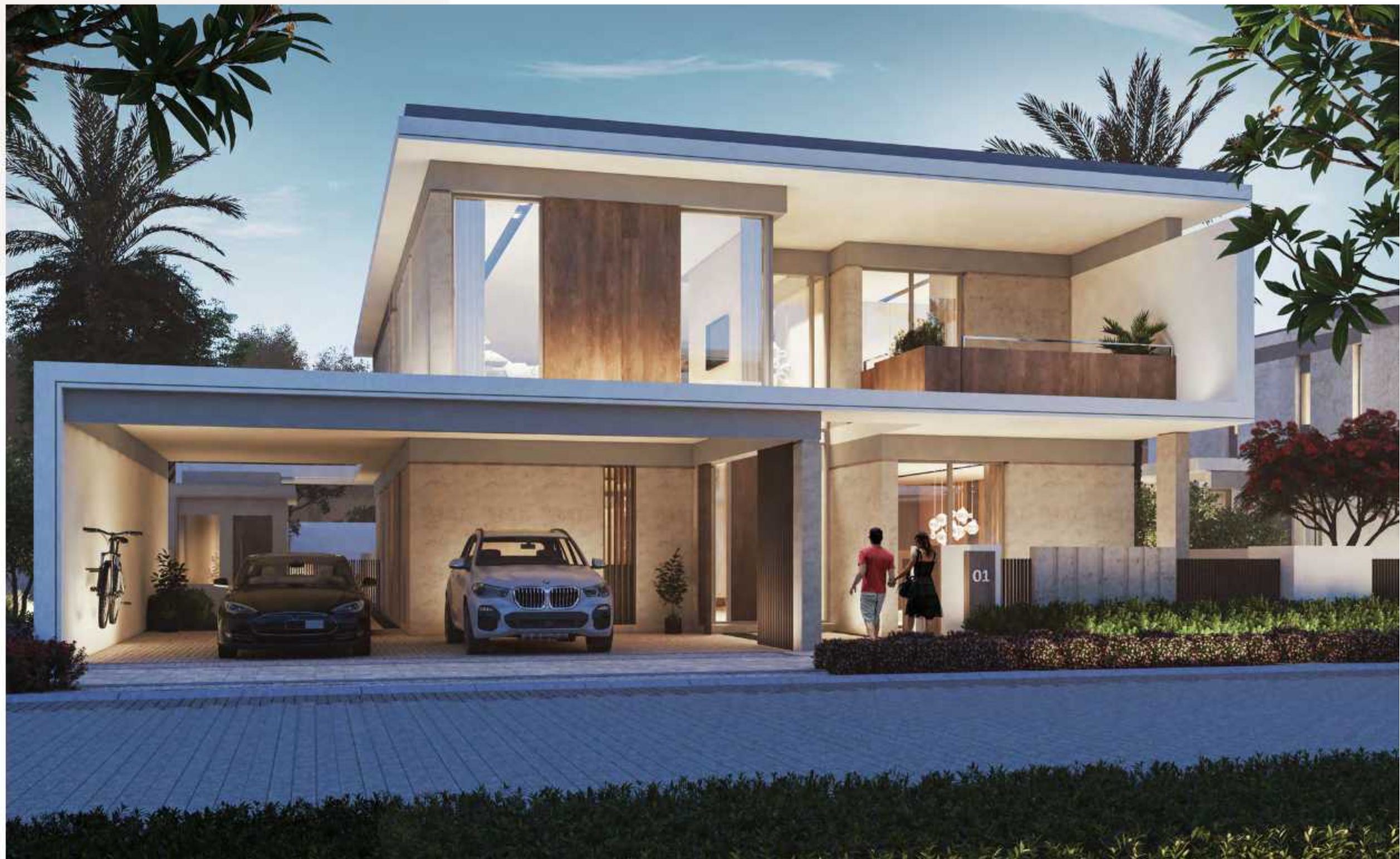
5 Bedroom Villa (Large) + Garden Suite - Front View

Modernity and elegance are celebrated in the five-bedroom villa. Its' expansive plot size means spacious living areas - large garden, room areas that are naturally lit with en-suite bathrooms, a stylish independent closed kitchen generous in dimensions, no shortage of storage and large walk in closet within the master bedroom. The arrangement of the family room is yours to choose.