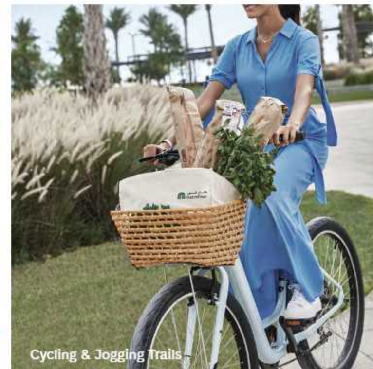
Cycling & Jogging Trails